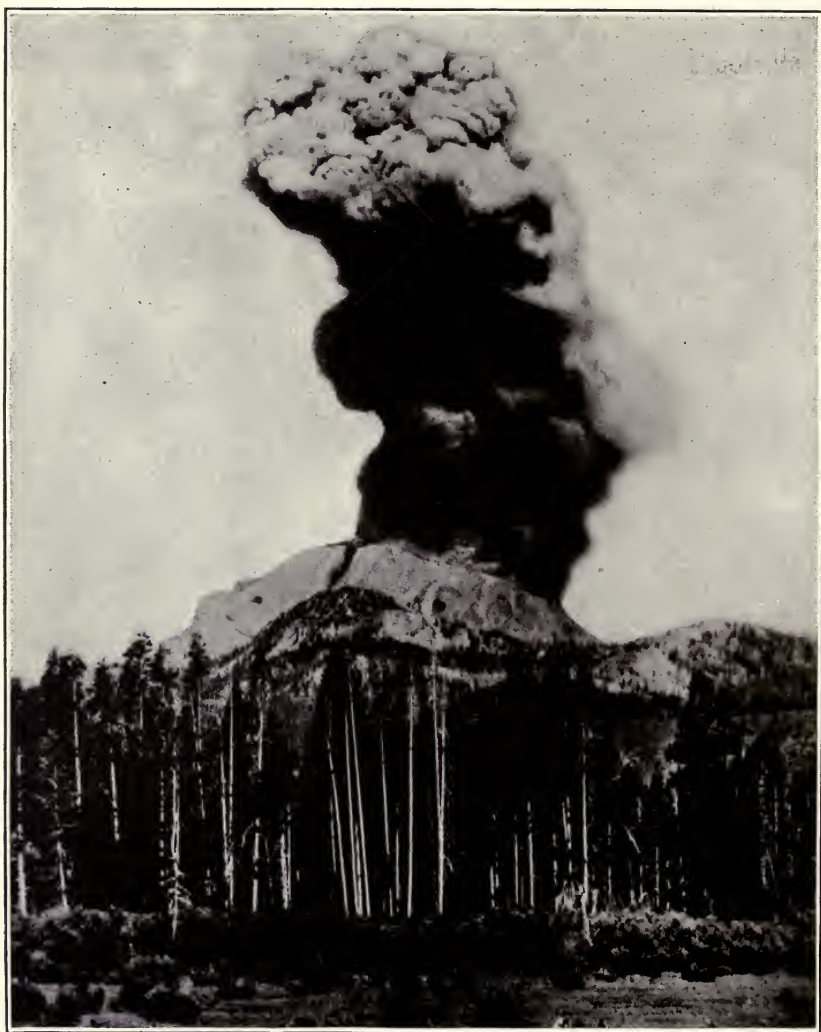
FIG. 7.—Lassen Peak in its twenty-ninth eruption, at 12.30 p. m. August 22, 1914, as seen from Warner Valley near Lees, about 12 miles southeast of the crater. The dust-laden column of volcanic vapors rises more than 6,000 feet without spreading.

rangers were in the field, but at other times Miss Alice Dines, postmaster at Manton, and G. W. Olsen at Chester, both living in sight of the mountain, supplemented the record. The eruptions have been tabulated as to time, intensity, and duration, and the tabulation has